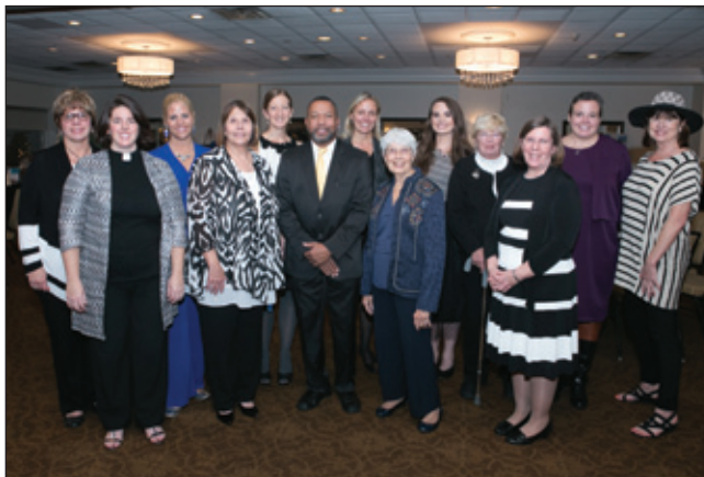
Fundraiser planning committee